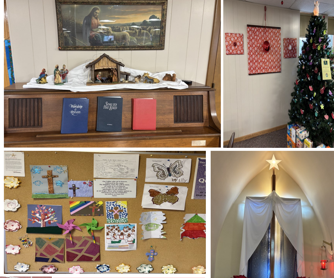
Be sure to stop in and look at the Sunday school activity board. They have been busy learning & doing many crafts with Melissa K.