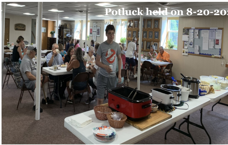
Potluck held on 8-20-2023 after the outdoor service