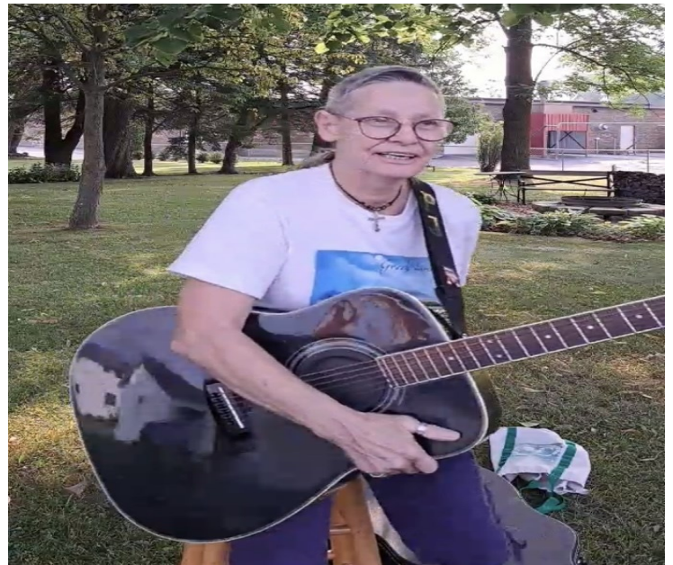
Special music by: PJ Prothero