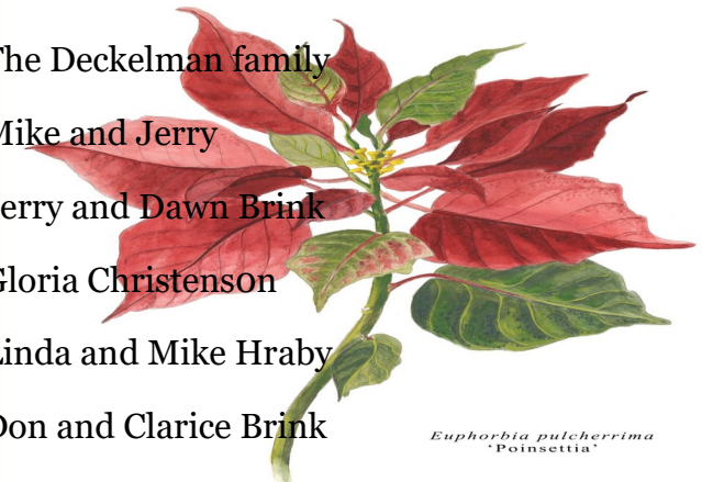
Euphorbia pulcherrima "Poinsettia"

All use restricted under terms of Creative Commons license and artist copyright.